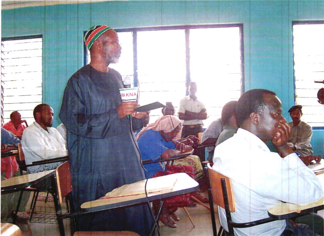
A livestock farmer presenting a memorandum to the Committee at Garissa Farmers College.