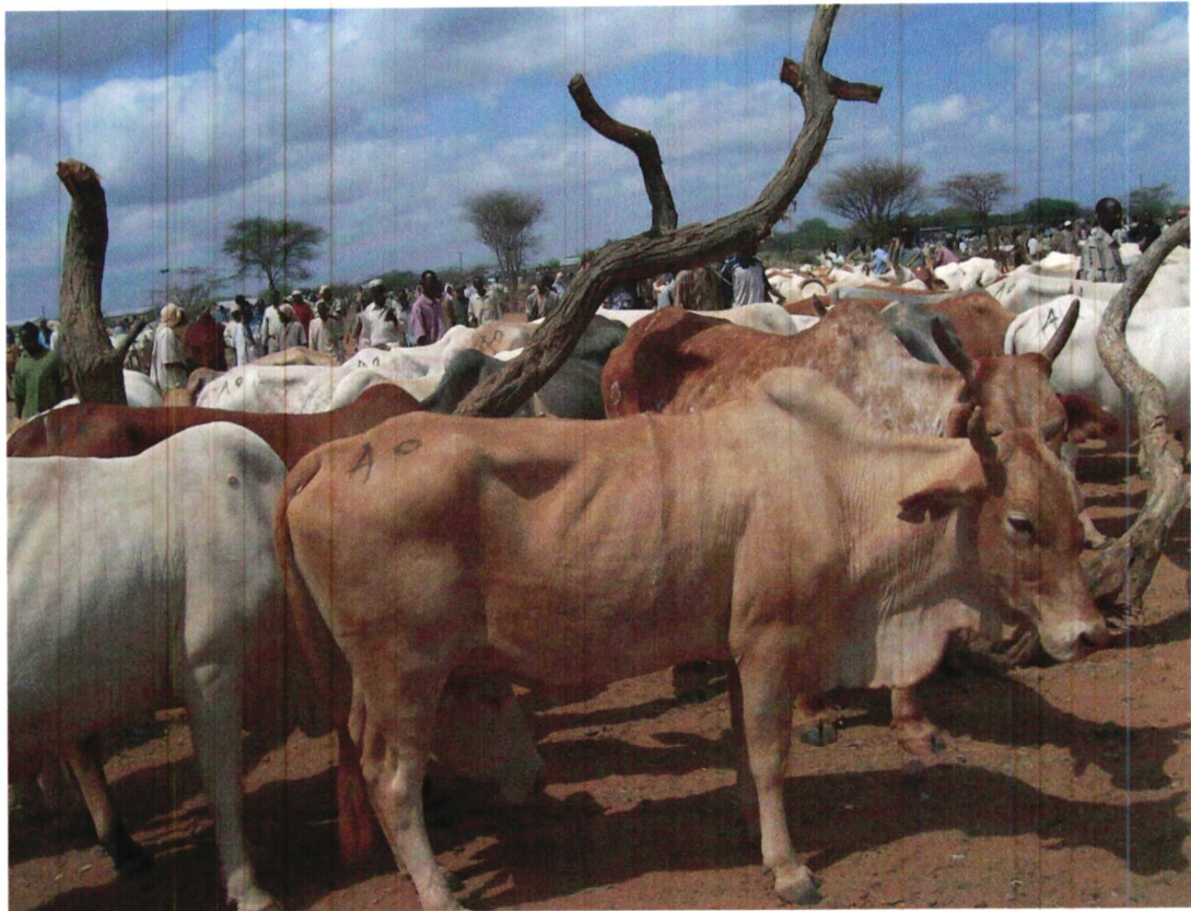
The Boran Species, commonly found in North Eastern Province