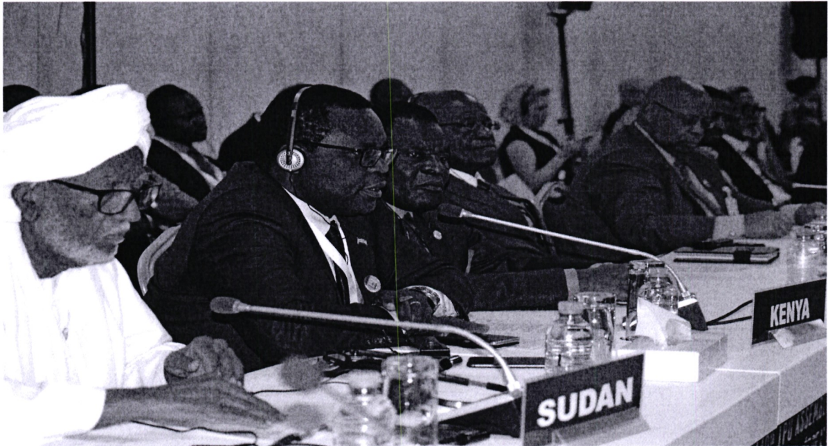
The Rt. Honourable Speaker of the Senate, Sen. Kenneth M. Lusaka, MP together with Amb. Paddy C. Ahenda, the Ambassador of Kenya to the Kingdom of Qatar during a Speaker's Round Table meeting at the 140 th IPU Assembly